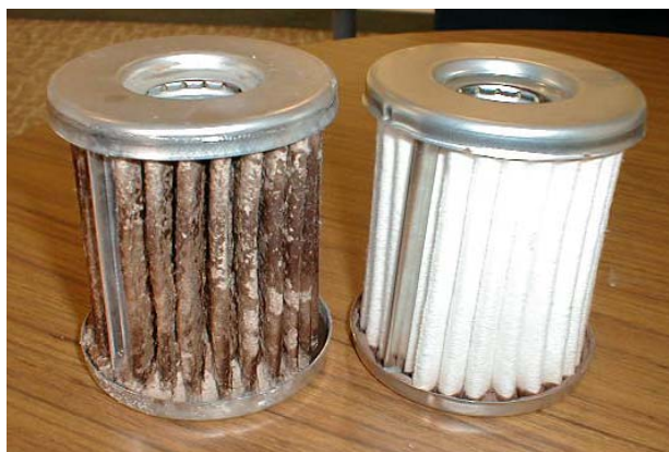
Figure 1 – Plugged Dispenser Filter vs. new

When dispenser flow slows to about half its normal rate (at gas stations from 10-12 gpm to around 5 gpm or at truckstops from 30 or more gpm to about 15 gpm), it is an indication that the dispenser filter requires attention and needs to be replaced. However, reduced dispenser flows along with frequent filter replacement, constant system maintenance or customer complaints may indicate that a more systemic problem exists as opposed to routine maintenance. Signs of fuel or fuel system issues include plugged fuel lines, erratic gauge readings, a rotten-egg odor (of the fuel or filter), and frequent replacement of other components such as valves, rubber seals and hoses.